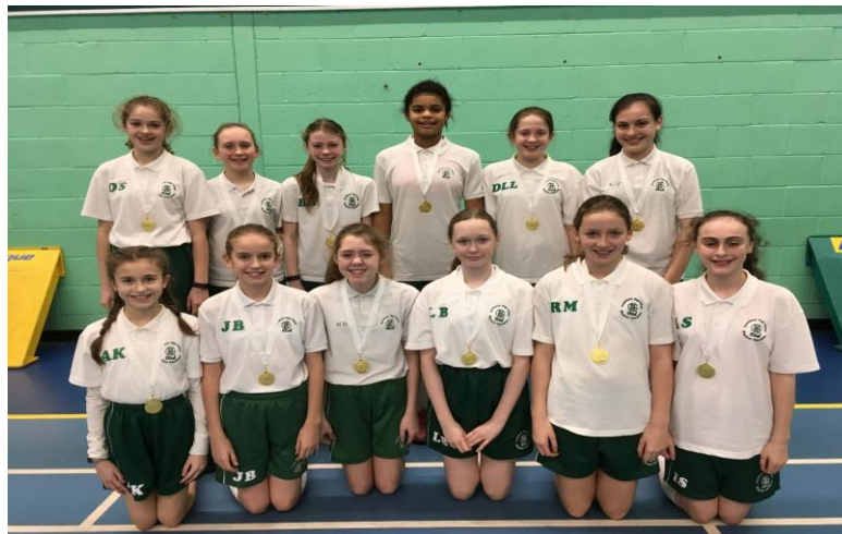
Congratulations to the Year 7 Indoor Athletics Team on being Southport and Formby Champions.