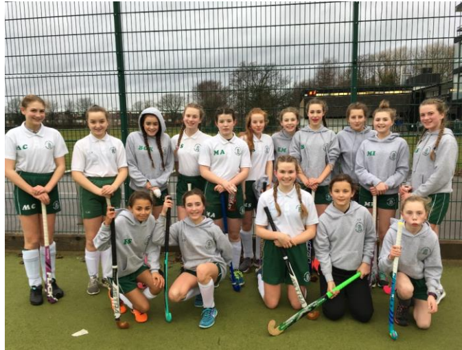
Congratulations to the Year 8 hockey Teams. The A team were Merseyside Runners Up and the B team were 6 th placed and the first Merseyside B team.