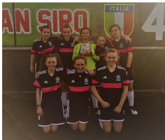
Congratulations to the Year 7 and 8 Football Team on becoming champions at the Sefton football festival.