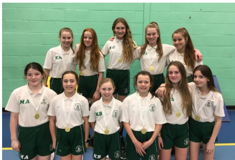
Congratulations to the Year 8 Indoor Athletics Team on being Southport and Formby Champions.