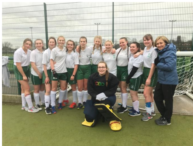
Congratulations to the Year 11 Hockey Team on becoming Merseyside Champions