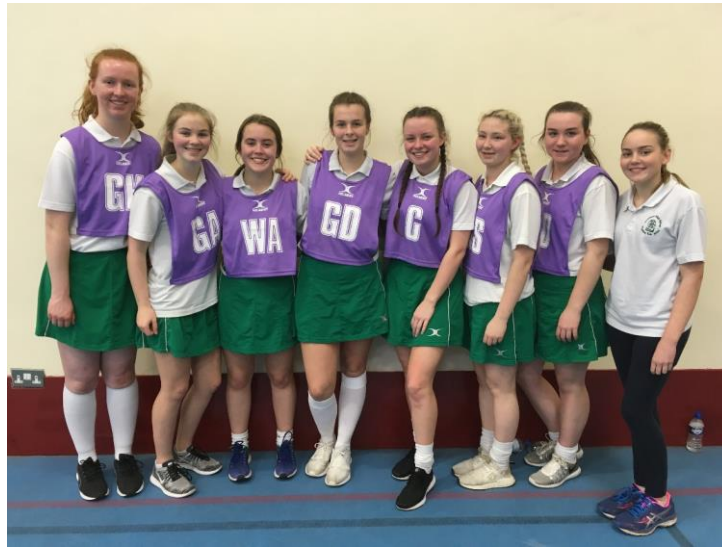
Congratulations to the Year 11 Netball Team on 3 rd place in the Liverpool Schools Netball competition and qualifying for Merseyside Championships.